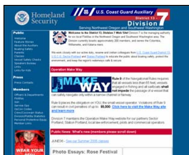
Division 7 of District 13