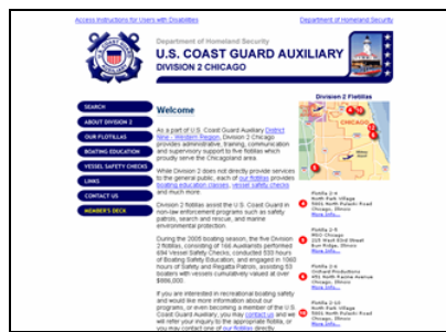
Division 2 of District 9 Western