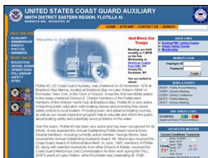
Flotilla 04-05 of District 9 Eastern